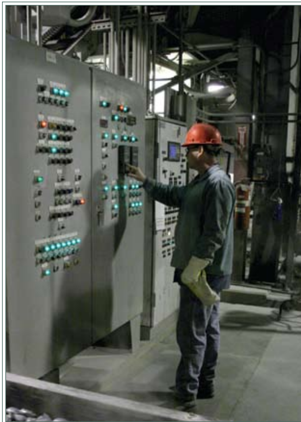
Molybdenum briquette production facilities

sublimation using a special electric furnace where tech oxide is heated until it vaporizes. On cooling, the vaporized oxide returns to the solid state but with virtually none of the impurities inherent in the tech oxide. This pure molybdenum trioxide is used for super alloys, chemicals and catalysts.