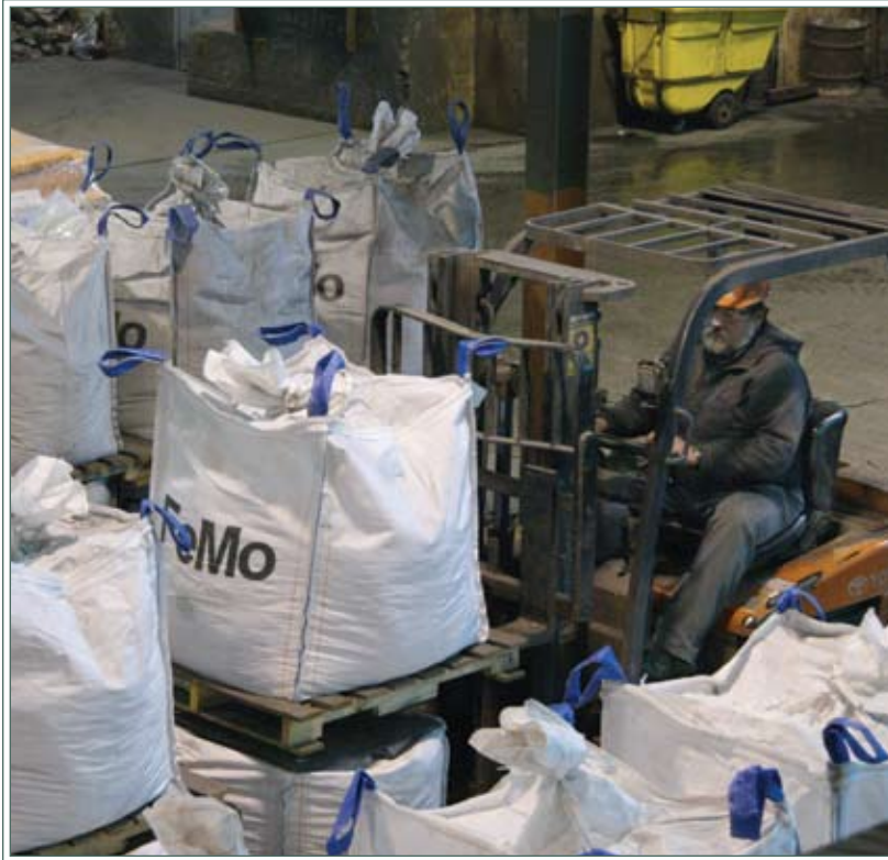
Ferromolybdenum ready for delivery to customers

The largest ferromolybdenum producer in North America, Langeloth is the first site to commercially convert \text{MoS}_2 concentrates to technical molybdenum oxide.